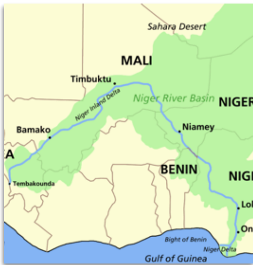
Niger river map.

Large parts of the Niger Basin contain flood-pulse dependent ecosystems, on which livelihoods depend. However, the Niger Basin has also experienced extensive hazardous flooding over the past two decades with millions of people affected. While there are some regional differences in magnitude, for most parts of the Niger Basin, the analysis found that hazardous floods are expected to increase, though the uncertainty range is large.