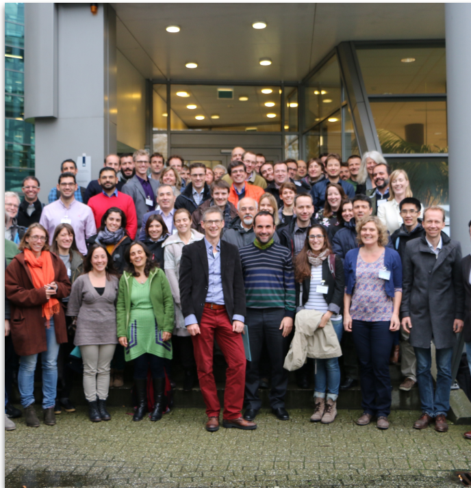
EU project IMPRES kicked off to improve predictions and management of hydrological extreme events

IMPRES received funding from the European Union's Horizon 2020 research and innovation programme under grant agreement No 641811.