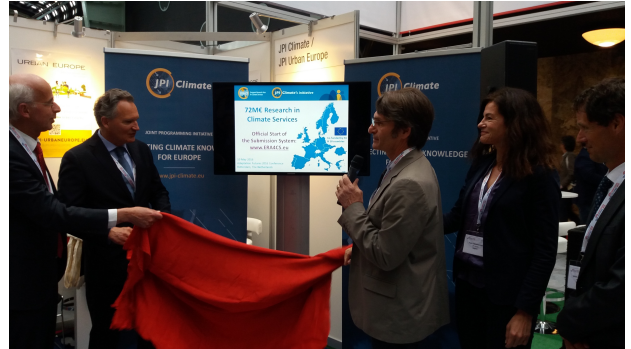
Unveiling of the official launch of the ERA4CS submission portal

barriers and enablers to co-develop and use climate services for adaptation as a for-profit service. The report and presentations are now available here . JPI Climate will build on these activities to implement its stakeholder engagement strategy with a follow up activity planned for autumn 2016, this time focusing on the specific sector of renewable energies and particularly on co-designing projects.