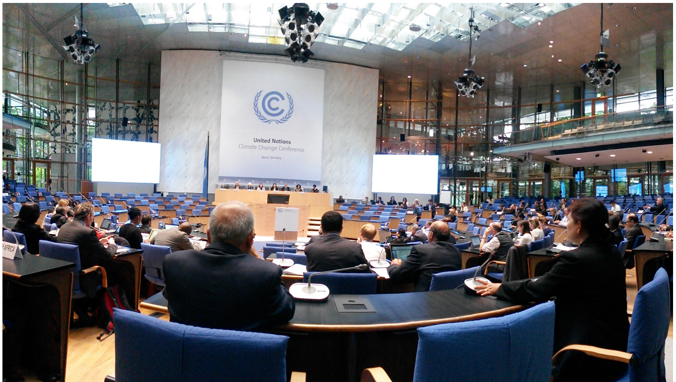
Technical Expert Meeting on Adaptation. Bonn, May 2016.

See here for more info: http://unfccc.int/meetings/bonn_may_2016/meeting/9413.php